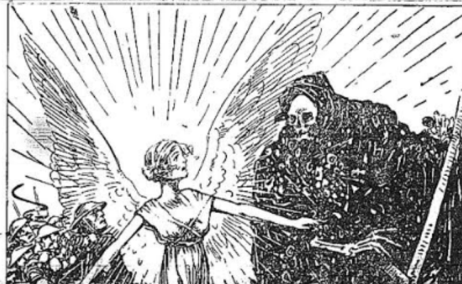
The Greatest News in the History of the World